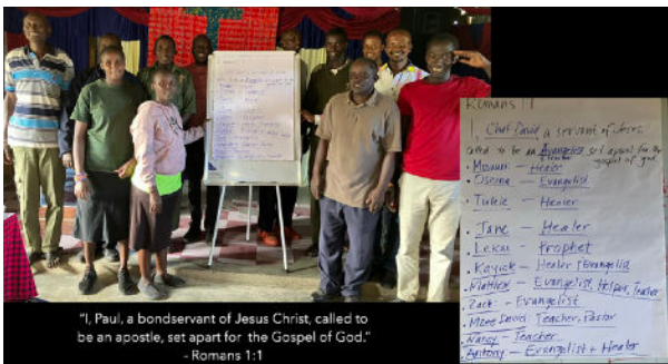
2nd Class: Graduation Day