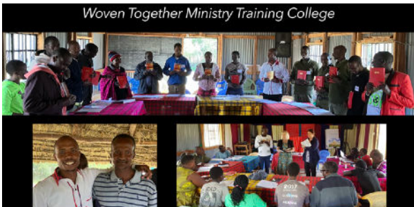
Woven Together Ministry Training College